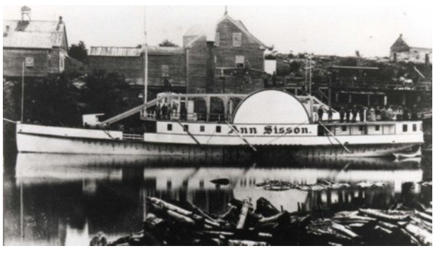
Figure 2.2 Steamer "Anne Sisson"