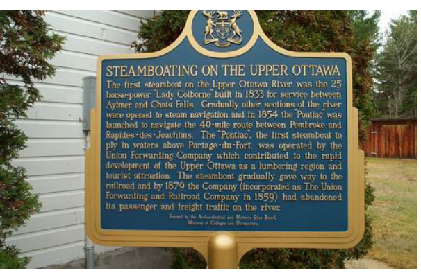
Figure 2.6 Historic Plaque on the Ottawa River