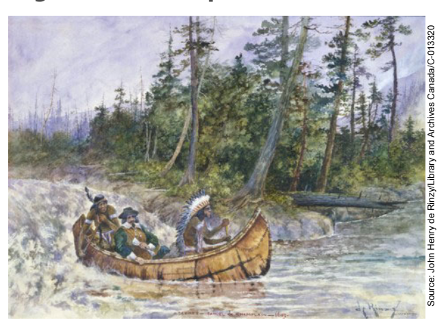
Figure 2.4 Champlain in a Canoe