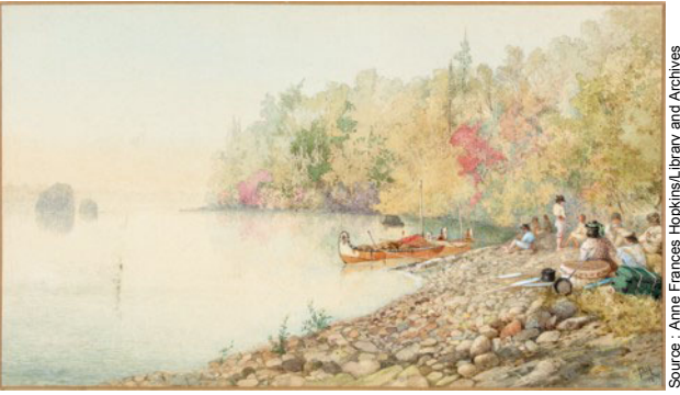
Figure 2.1 Encampment of Voyageurs, Ontario, 1870