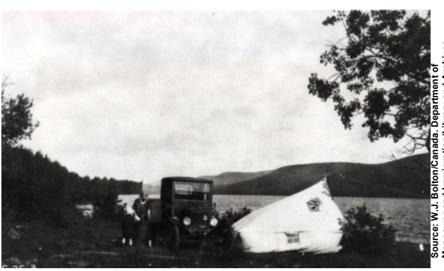
Figure 2.7 Camping in the Old Days

is exemplified by ongoing warfare between Iroquois and the Algonquin and Hurons in the 17th century as they sought control over the trading of beaver pelts. "Aboriginal/European conflict" occurred along the Ottawa when the Iroquois ambushed Dollard des Ormeaux's men near Carillon in 1660.