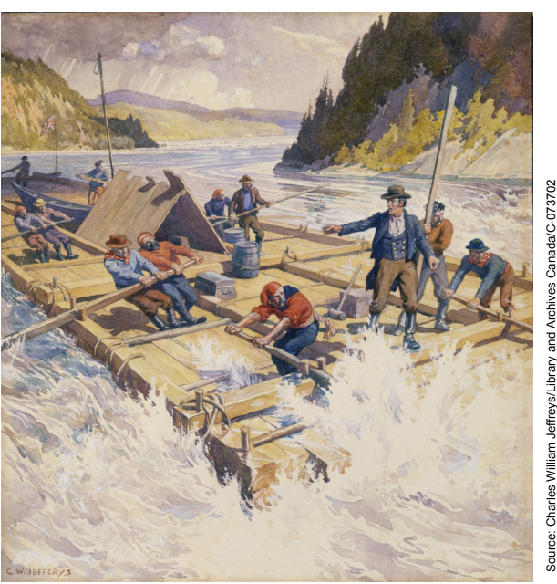
Figure 2.3 The First Lumber Raft Down the Ottawa River

French explorers and fur-trading voyageurs relied almost exclusively on the birchbark canoe. Voyageurs developed a larger canoe adapted to fit their needs, the 11 metre-long canots de maître used on the Ottawa River. Settlement along the river necessitated even larger craft, paving the way for the appearance of flat-bottomed batteaux, followed by Durham boats. Pembroke's famous Pointer Boat facilitated the lumbering industry on the